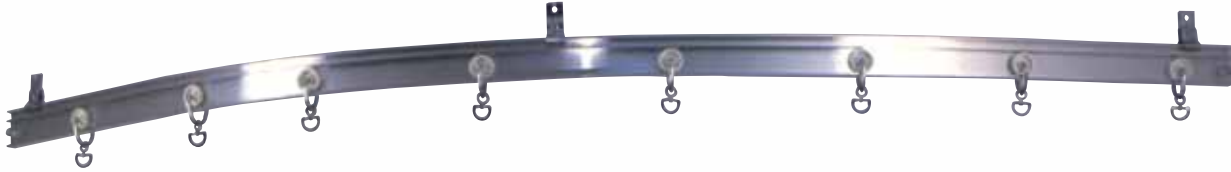
Model 132 Assembly