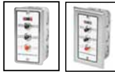
Close-up of RCS-1 (standard) Close-up of RCS-2 (optional)